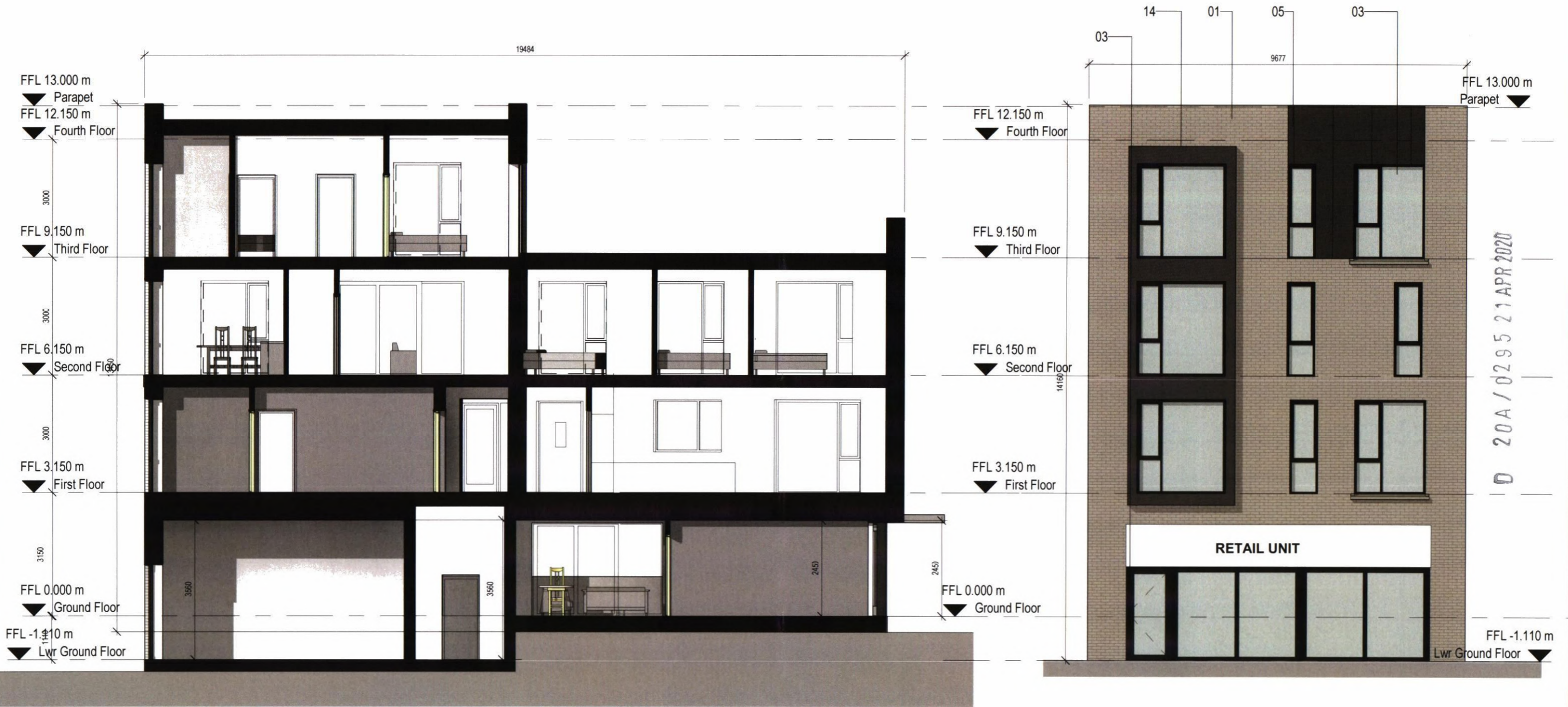
Section A-A 1 : 100