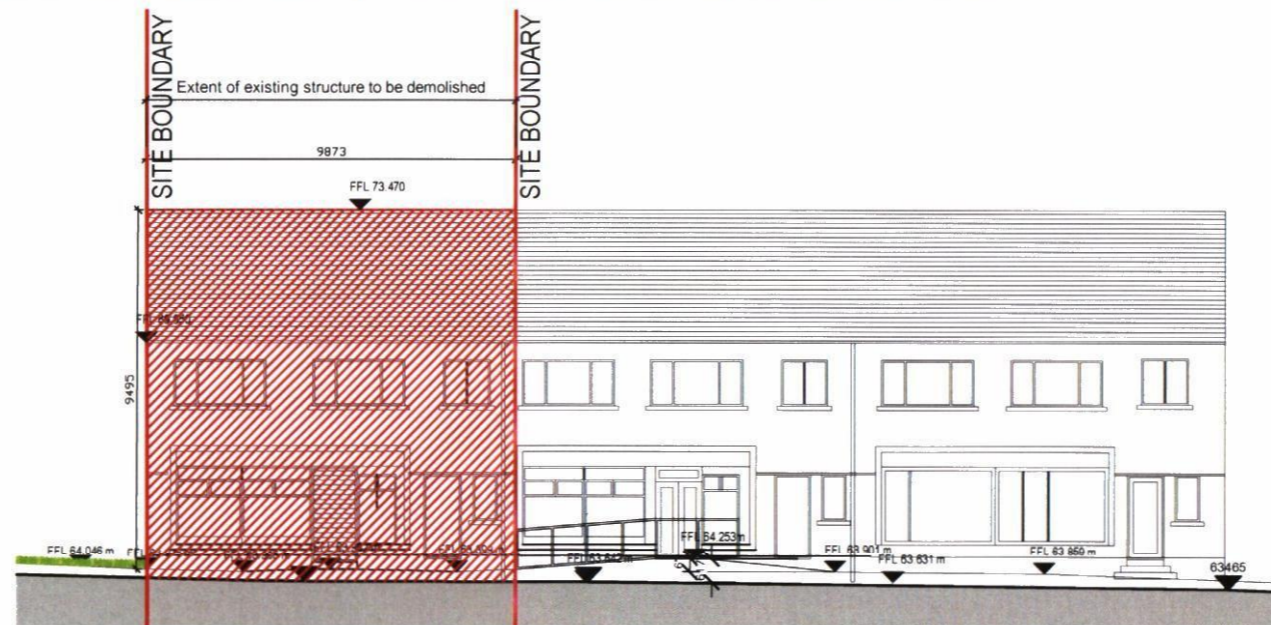
EXISTING NORTH ELEVATION SCALE 1:200 @A3